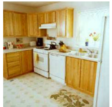
Noji Gardens in Seattle, WA.

Innovations in housing design, construction, and production can result in significant cost savings and more vibrant communities.<sup>58</sup> When permitted by local zoning and building codes, alternatives to the standard stick-built single-family detached home cannot only be chosen to expand the range of housing choices, but also to lower costs for developers and consumers. Innovations include the use of party walls to build duplexes or rowhouses, the use of pre-fabricated building components, such as roof tresses, designs for multifamily housing that ensure privacy and mitigate noise, the construction of small homes for starter households (particularly when paired with nearby access to open space), adherence to traditional neighborhood design (TND) standards in build-