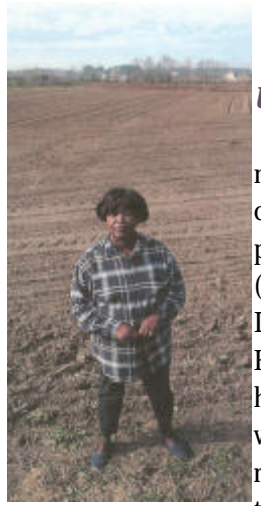
Famer proposed site for prison in Bayview, VA.