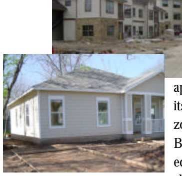
SMA RT Projects in A ustin, Texas.

Issues to Consider: Some approaches to managing land use decision making have included the creation of "one-stop" centers for permits and development