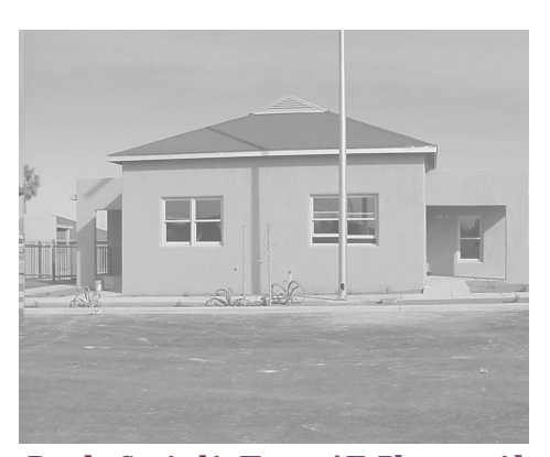
Posadas Sentinal in Tucson, AZ.

Issues to Consider: HOPE VI, despite its prospects for success, is a contentious program. Housing advocates decry its partial replacement of the housing structures destroyed and therefore the displacement of residents during the redevelopment process; it has also been criticized for failing to involve residents in